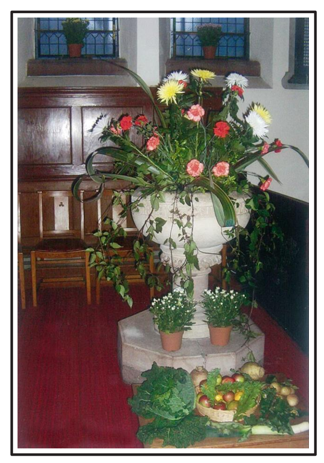
SUNDAY WORSHIP AT 11am 1st Sunday Holy Communion 2nd and 4th Sundays Morning Prayer 3rd Sunday Informal Family Service

SERVING CHRIST IN THE COMMUNITY SINCE 1895